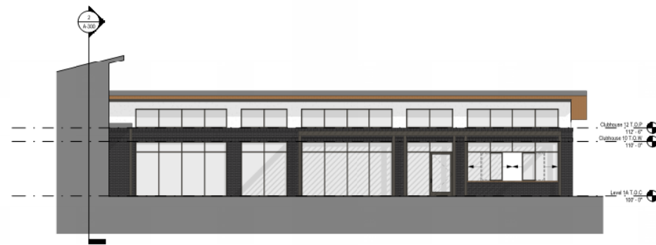
3 | Clubhouse - West Courtyard Elevation Scale: 1/8" = 1'-0"