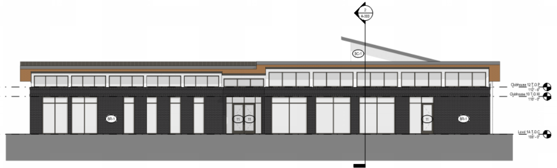
1 | Clubhouse - East Elevation Scale: 1/8" = 1'-0"