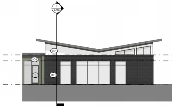
2 | Clubhouse - South Elevation Scale: 1/8" = 1'-0"