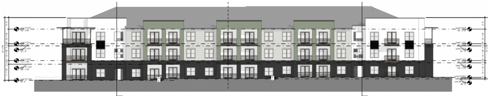
1 | Building 6 - East Elevation - Overall Scale 3/32" = 1'-0"