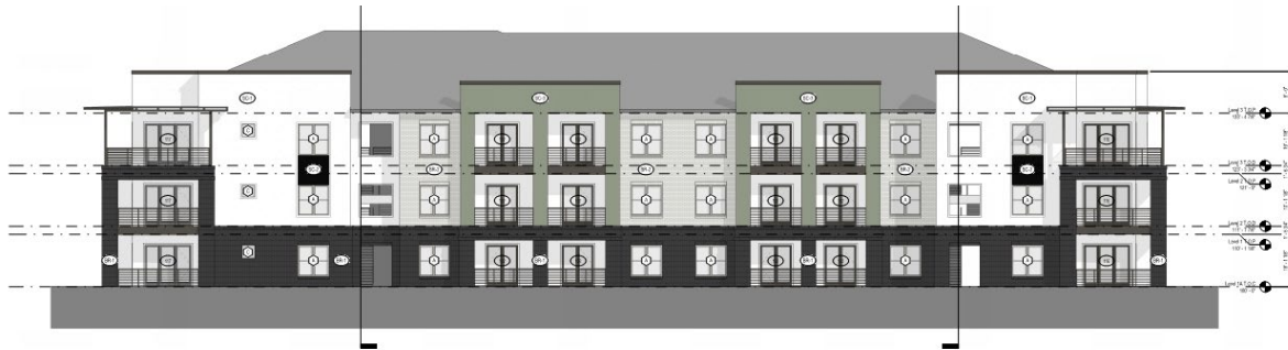
2 | Building 5 - North Elevation Scale 1/8" = 1'-0"